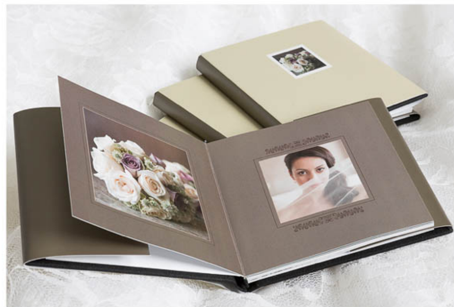
4x gift books (10x10)