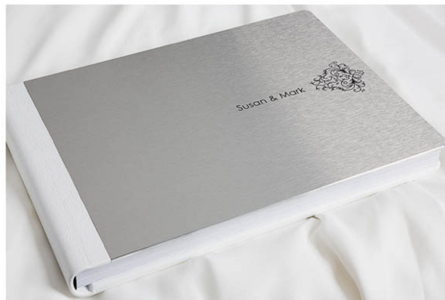
Parent book (30x20) upgraded with metal cover and white leather spine and back