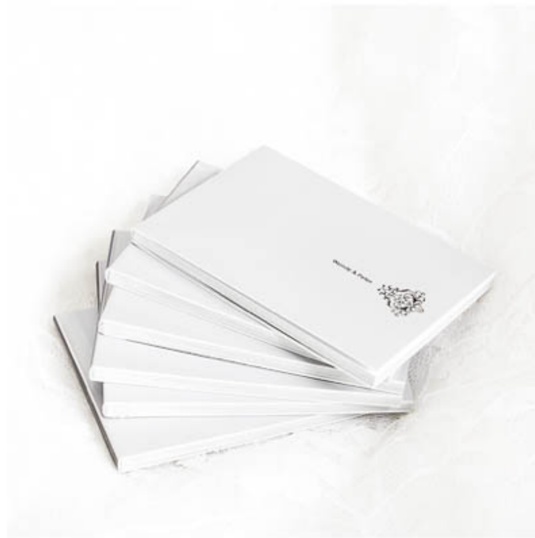
Pocket books, available in various sizes and quantities