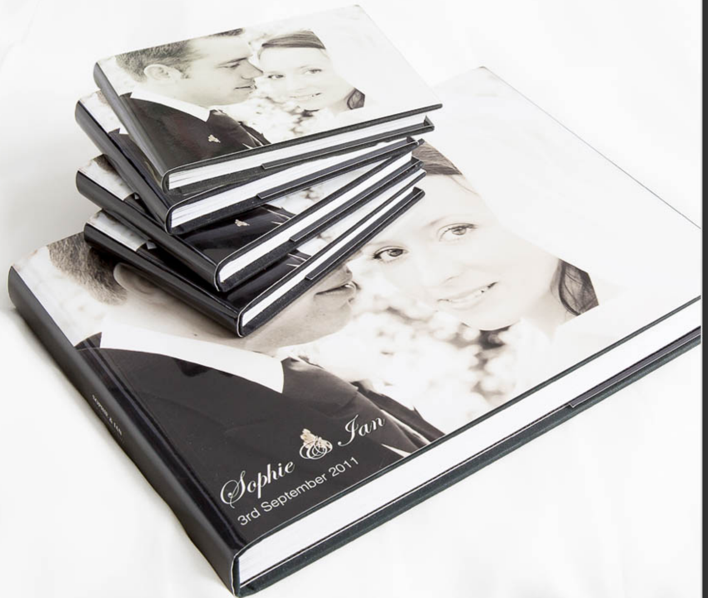
1x parent book (30x20), 4x gift books (130x100, all with dust jackets)