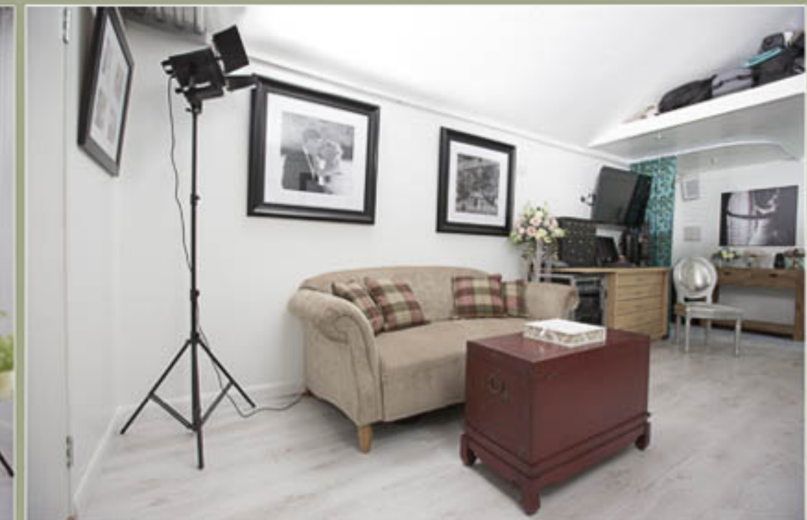
The studio, just outside Tunbridge Wells